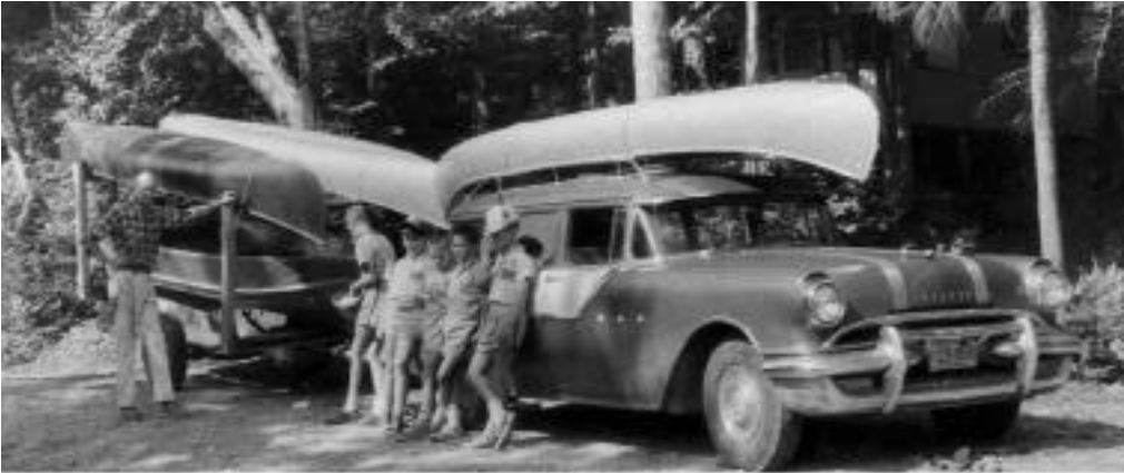
A canoe trip on its way circa 1960 - Chief, campers and Pontiac

Ambitious trips continued to be an important feature of camp, however. Chief, who often ended up acting as a sort of full-time chauffeur, found locations in remote areas and shuttled campers there in groups that gave everyone a chance to experience the back-country for a few days, canoeing and fishing. Rump Pond, near the New Hampshire and Canadian border, featured a log cabin and other amenities; other campsites were set up from scratch with tents and